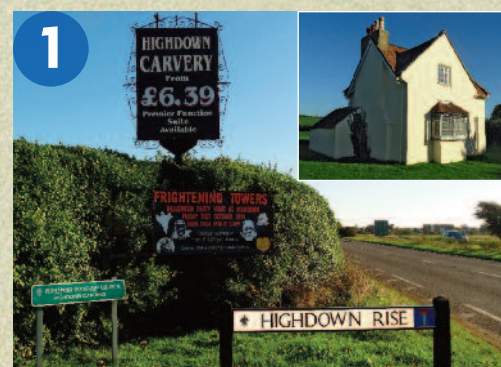
The entrance to Highdown Rise and (inset) a Lodge House