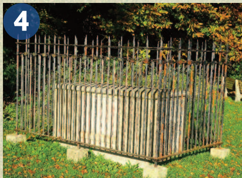
The Miller's Tomb