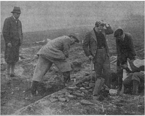
Archaeologists digging at Highdown in 1937