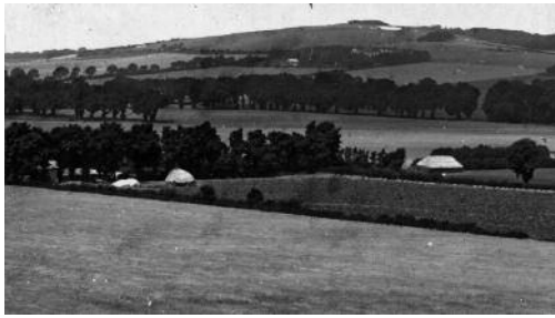
Highdown c.1910

housing estates sprawl to the east, south and west, it is astonishing to read her account of those days –