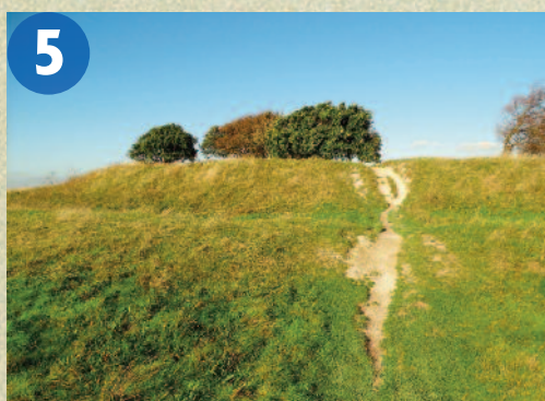
The Highdown Hillfort